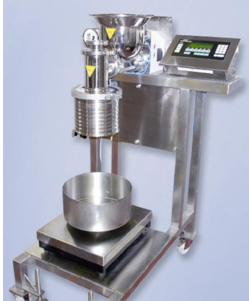
Photo 1: K-Tron volumetric feeder with integrated ILC Dover continuous liner

In the case of photo 1, the end user utilized a portable K-Tron volumetric feeder with a modified discharge complete with an integrated ILC Dover continuous