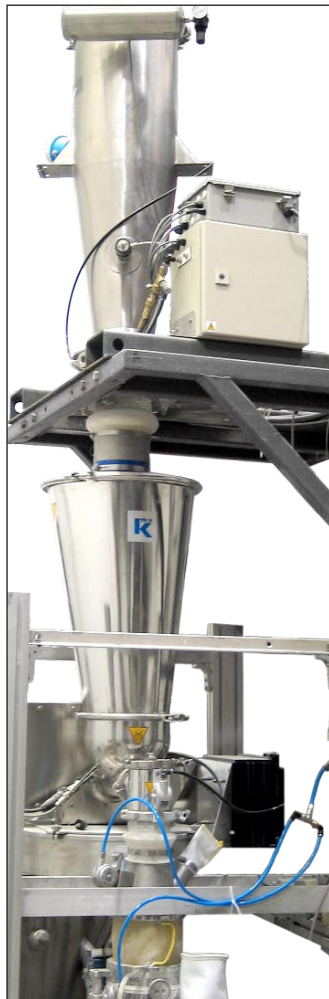
PCS pneumatic refill receiver above K-Tron LIW feeder

In all cases it is critical that the overall sequencing of the product pickup process and relative sizing of both the feeder refill hopper and pneumatic receiver allow for quick changeover of these pickup points without interruption of the process. For example, in cases with an IBC docking station equipped with a pneumatic pickup and a split butterfly valve, the time for changeover to a new bin can often be as much as 15 minutes. Refill sequencing and feeder hopper volume must ensure continuous material flow for the process and allow for lack of material delivery while these pick up components