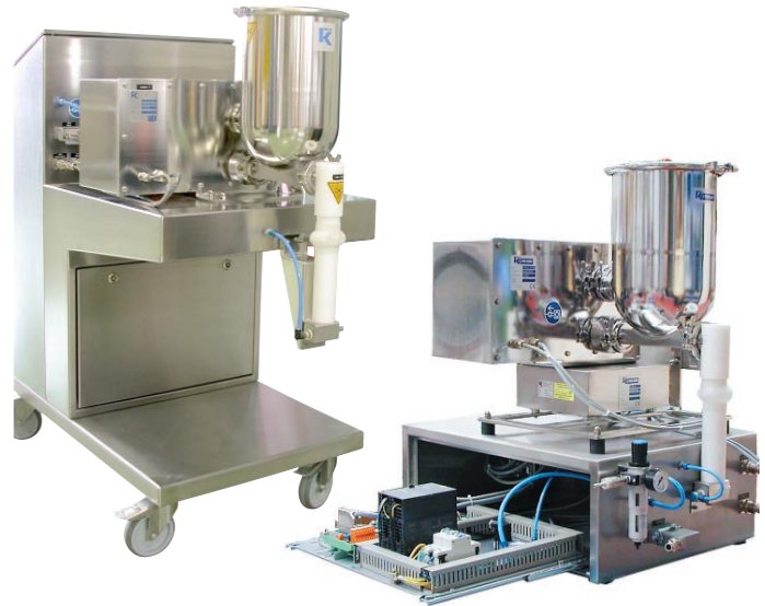
Left: Volumetric Tablet Press Lubricant Feeder integrated on a portable cart